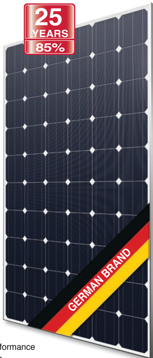
Fig. similar 60M156EN171019A

Exclusive linear AXITEC high performance guarantee!