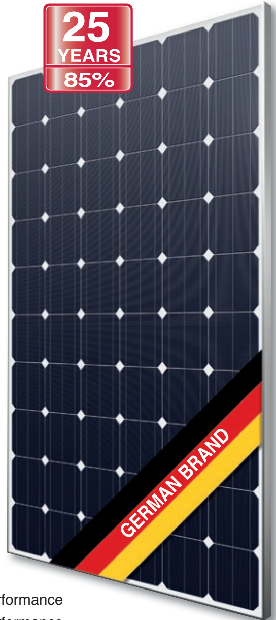
Fig. similar 60M156EN171122A-77/2 Q

Exclusive linear AXITEC high performance guarantee!